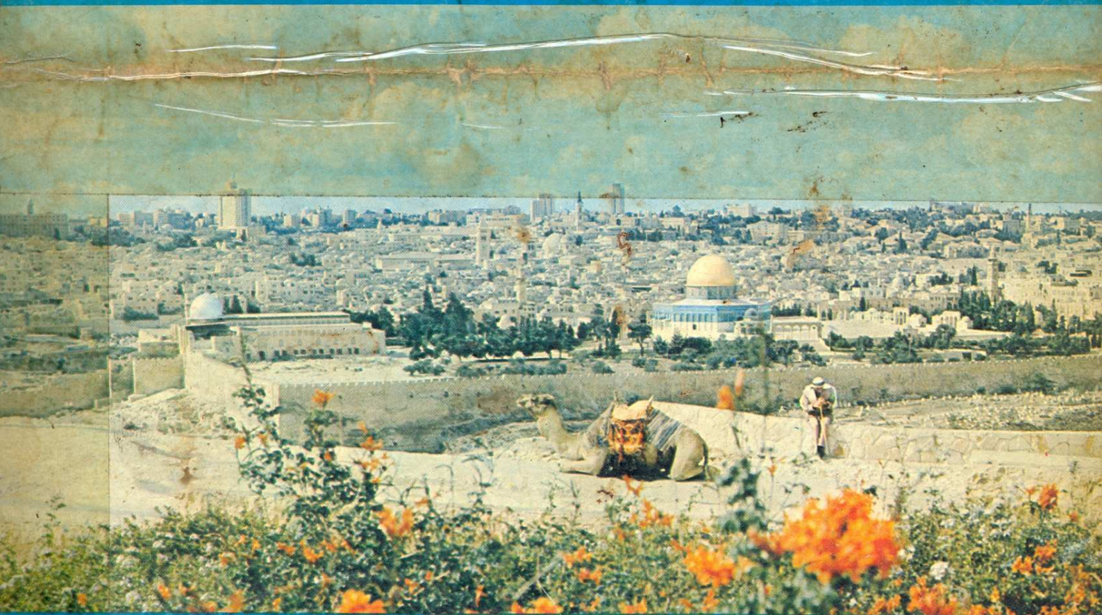
Jerusalem — Glory of the past, Hope of the future; City from which the Lord will rule the world. (Isaiah 24:23).