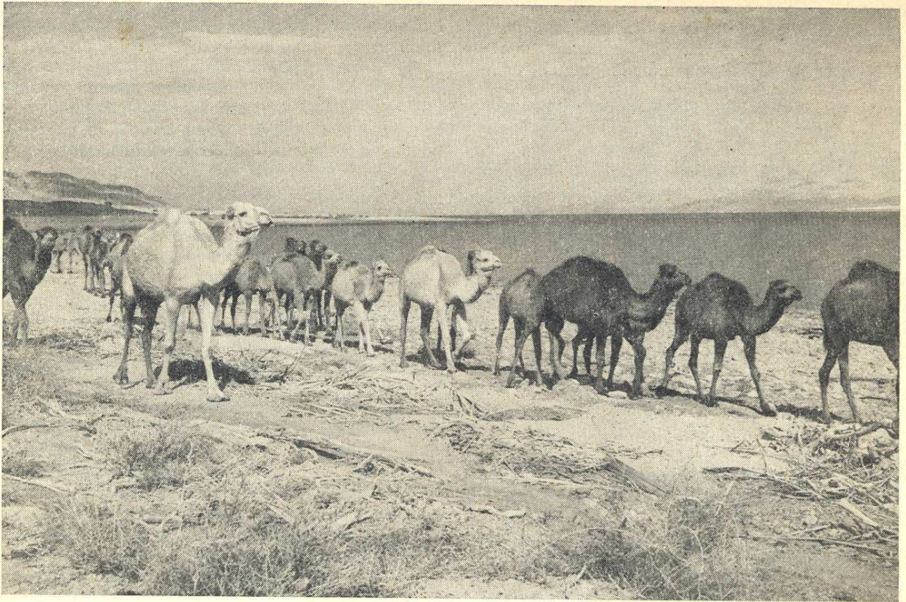
Camel herd by the shores of the Dead Sea. — The Dead Sea, located in the region of ancient Sodom and Gomorrah, is 47 miles long by 10 miles wide and, at 1,273 feet below sea level, it is the lowest spot on earth. Its water is also the saltiest in the world, being 27 per cent solids. This is caused by the fact that, although the Dead Sea is fed by the Jordan River and other smaller streams, it has no outlet other than evaporation; and as the water evaporates it leaves behind a heavy concentration of minerals.