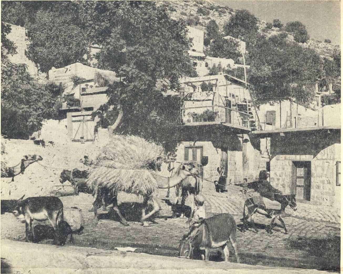
Pki' in — Druse Village in northern Israel

Turks, Beduin and others, brought in loyal Druses to occupy fourteen defensive villages along the frontier that ran east-west between Tiberias and Haifa. On his violent death and with the dissolution of the Druse leadership, these villages succumbed to enemy raids; the only two to survive, Ussfiya and Daliyat el-Carmel, flourish to this day in their lofty eyries. Daliyat el-Carmel, with a population of 8,000, is the largest Druse village in Israel; overlooking the Esdraelon Valley and Haifa, its main street becomingly flanked by displays of Druse handicraft, it attracts many tourists.